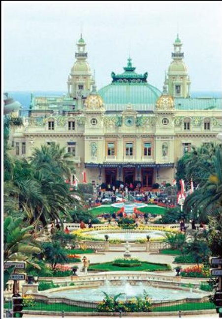
The Monte Carlo Casino